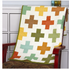
On the Plus Side